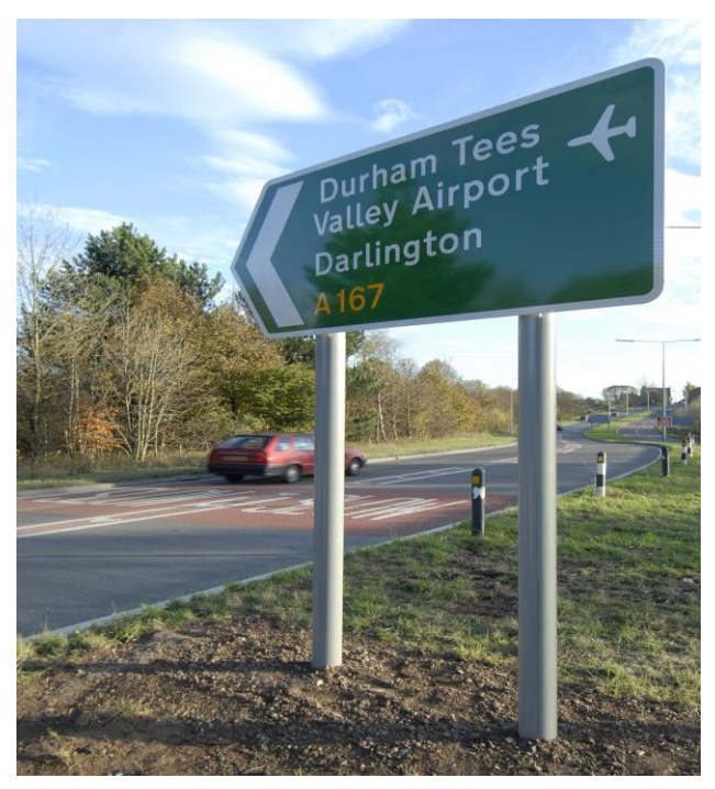
Typical installation of an FSP post

Note: A range of colour options and anti fly poster coatings are available on request.